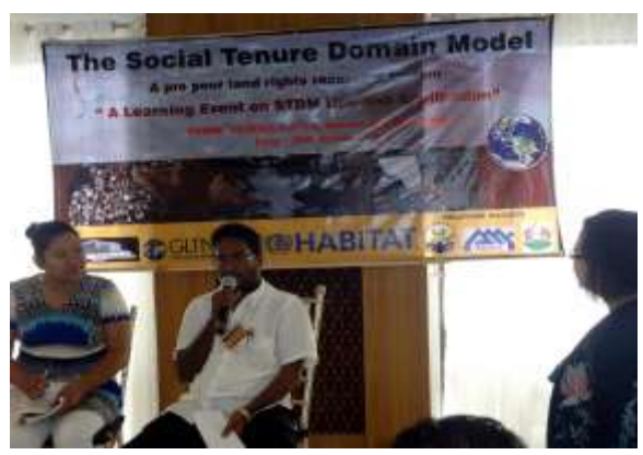
STDM WORKSHOP 22-25 OCT 2013, PHILIPPINES

- IHPF HOUSING CONFERENCE 13-14 APRIL 2014, HAGUE